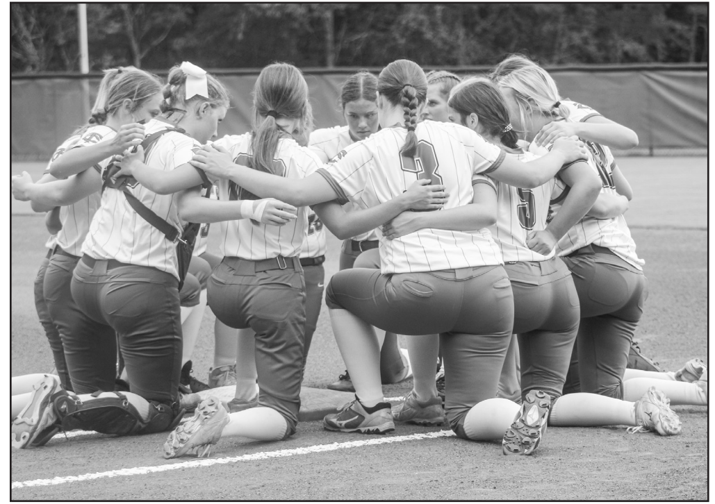
Towns County delivered a 16-1 rout vs. Chestatee on Aug. 23.